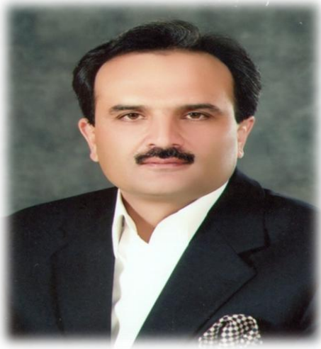
MR. AMIR HAIDER KHAN HOTI CHIEF MINISTER OF KHYBER PAKHTUNKHWA

The secretaries of these departments may be made responsible to brief the cabinet on monthly basis about progress against certain indicators, like school attendance, percentage of students that have cleared their exams, number of visits made by different officers, teacher's absenteeism, etc. It is pertinent to mention here that such indicators along with effective monitoring mechanisms are already in place at least on paper. It is the follow up of these mechanisms and their implementation which needs a lot of emphasis and is the real key to success. By the Grace of Almighty Allah this year as per our commitment we have successfully introduced output based budgeting throughout the province for ensuring sound mechanisms for effective service delivery and performance measurement.